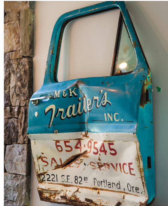
Above (clockwise from left): Hexagonal concrete tiles lead you into the dining room, which is a combination of building materials including concrete, stone, steel, and wood. The custom chandelier is accompanied by vintage chairs, playful pillows, and accessories; a collection of vintage pieces are found throughout the house including a car door and neon arrow sign.