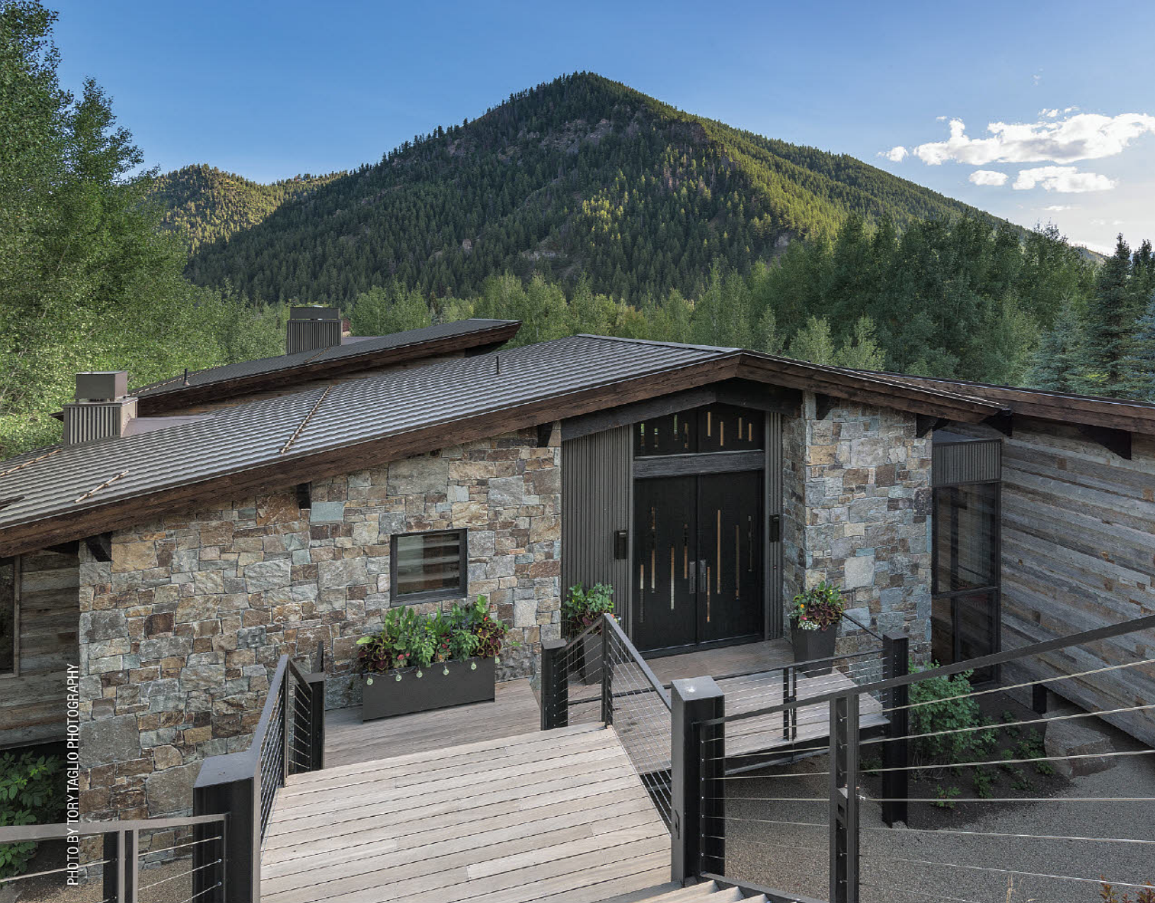
Above: The entry staircase to the house creates a warm entrance.

ban. Translated as “the burning of Japanese cypress (sugi),” shou-sugi-ban literally involves burning the exterior of the wood to create a dramatic silver-black finish. The process renders wood nearly maintenance-free and makes it resistant to fire, rot, and pests. The finish created by this method also has an expected life span of more than 80 to 100 years, thanks to a protective layer created by carbon released during the burning process.